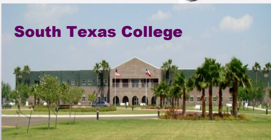
South Texas College

Ranked by Community College Week , a national education journal, as one of the top 100 community colleges in the country and 2nd in awarding associate degrees in all disciplines to Hispanic students.